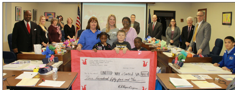
Students at R. S. Payne raise money for United Way Education Readiness Initiative. Through a friendly classroom competition, students collected change over three weeks to raise $455.