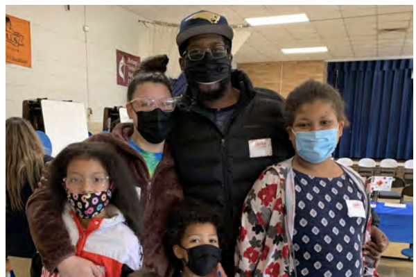
Parental Engagement Program at Heritage Elementary School

The Lynchburg City Schools Education Foundation, Inc., hosted our sixteenth annual Breakfast with the Superintendent as a virtual event on Thursday, March 17, 2022. This event provided an opportunity for local business and community leaders as well as interested citizens to learn more about the Lynchburg City Schools from school leadership.