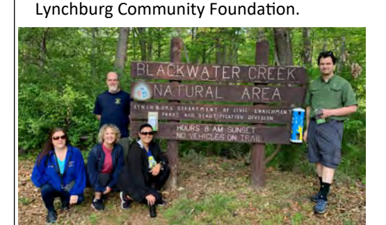
Blackwater Creek Trail Hike lea by Blue Ridge Mountains Council-Boy Scouts of America representatives.

The LCS Fabulous Morning of Wellness allowed LCS employees to select a fun, leisure, or personal growth activity from a large range of choices courtesy of local businesses. In addition to demonstrating our appreciation, this day also provided opportunities for teachers and staff across the division to build an 'LCS Team' by connecting with other employees with similar interests, as well as allowing our teachers to experience opportunities within our community that may be of value to their family or classroom. 533 LCS employees chose from 48 offerings and fanned out across the city to enjoy a Fabulous Morning of Wellness! This event was possible thanks to generous contributions from International Paper and the Greater