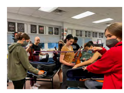
LCS Ed Foundation promotes arts education and equity by ensuring any student can participate in the exceptional LCS Strings Program.