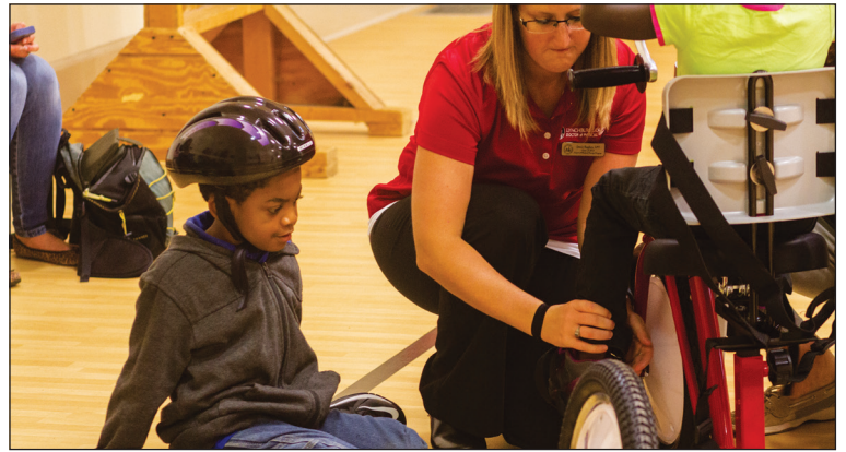
Lynchburg College Physical Therapy students raise money to purchase an adaptive tricycle for R. S. Payne Elementary School. Students ride it daily as part of the school's movement ed classes.

LCS is one of 14 school divisions across the state to receive non-infrastructure grant awards from The Virginia Department of Education. The grant supports the city's current initiative to provide safer walking and biking options around the city. The city is currently working on transportation improvements that will help students walk and bike to school, promoting healthy activities from an early age. This work includes pavement markings, new sidewalks, new pedestrian signs, and curb ramps, made possible through a separate infrastructure