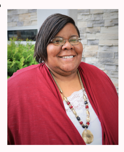
Motto "Realizing the Possibilities – Promoting the Change"